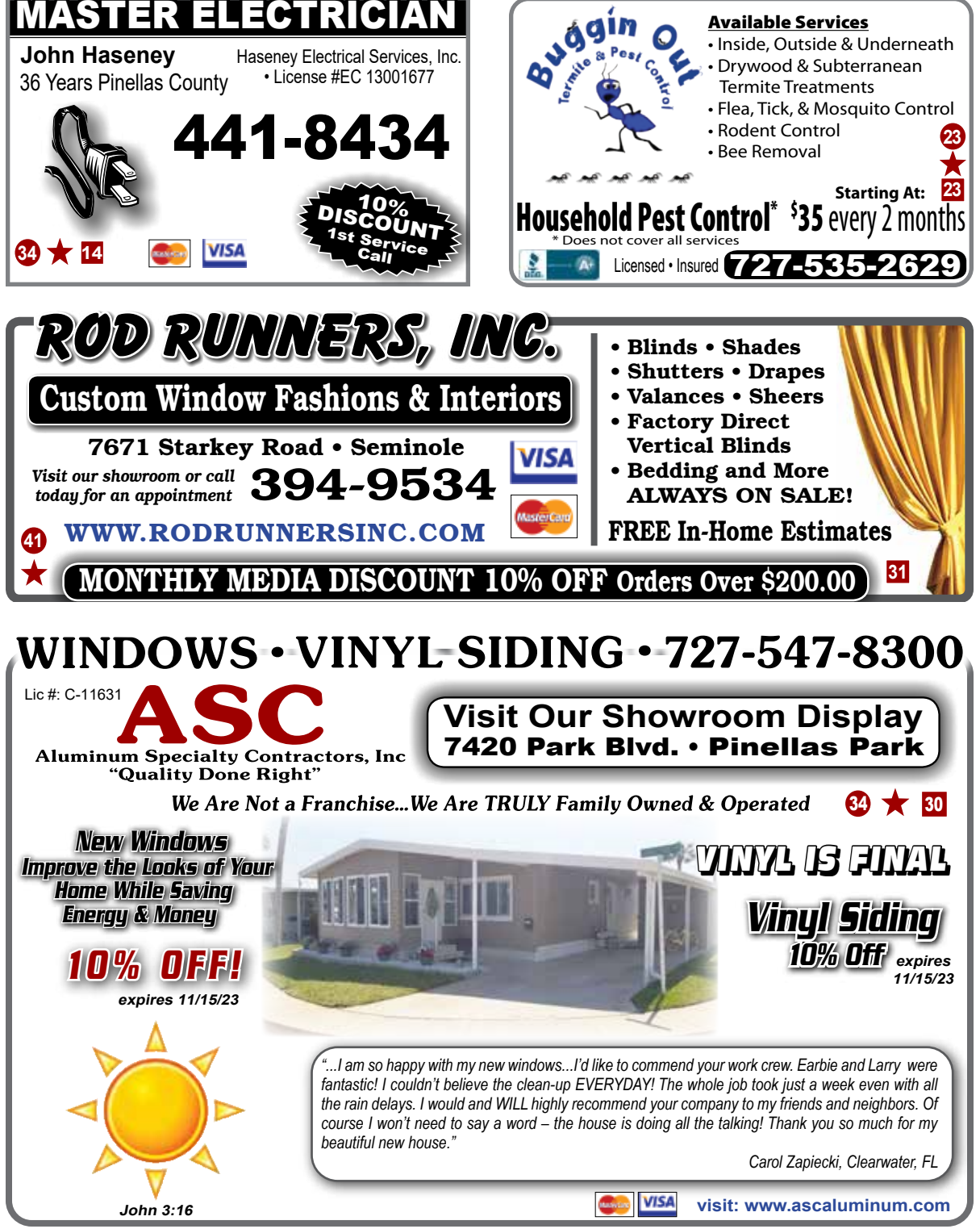
SUNSET PALMS SPOTLIGHT NOVEMBER, 2023 D